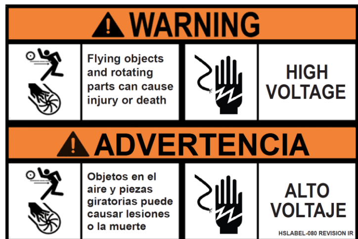
Figure 1: HSLABEL-080 Warning Label

Ground all non-current carrying metal parts to guard against electrical shock. With the exception of motor overload protection, electrical disconnects and over current protection are not supplied with the equipment.