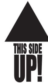
Figure 3: HSLABEL-347 Installation Orientation Label

When installed or used as a mobile unit to move free air, the fan must be oriented with the motor capacitor on top. Failure to do this may eventually lead to premature failure of the capacitor due to concentration of excessive moisture. The label on the right will be located on both sides of the fan venturi to ensure the fan is installed and/or operated in the correct orientation.