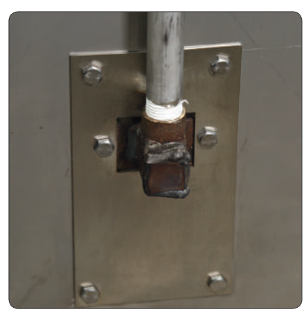
Two-Piece Water Bar Vertical pipe is easily removed from horizontal bar, aids in maintenance.