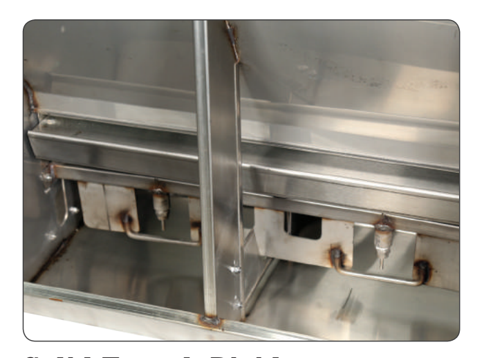
Solid Trough Dividers Reduce feed waste and increase durability.