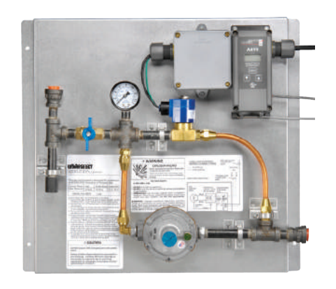
On/Off Control w/ Thermostat