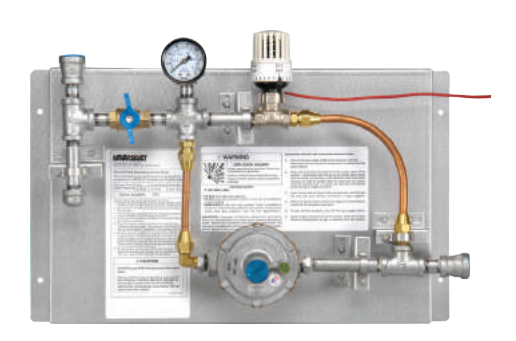
Modulating Control Panel