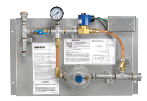
On/ Off Control Panel

For use with house controller systems, must be hardwired to 110v source.